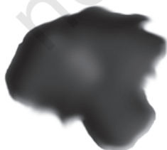
Fig. 5.3: Coal tar

It is a black, thick liquid (Fig. 5.3) with an unpleasant smell. It is a mixture of