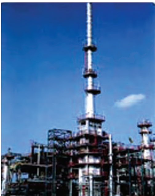
Fig. 5.5: A petroleum refinery

separating the various constituents/fractions of petroleum is known as refining. It is carried out in a petroleum refinery (Fig. 5.5).