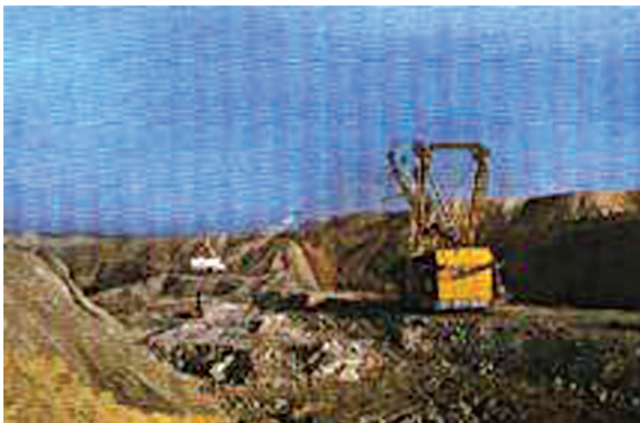
Fig. 5.2: A coal mine

When heated in air, coal burns and produces mainly carbon dioxide gas.