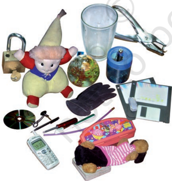
Fig. 4.1 Objects around us

Let us collect as many objects as possible, from around us. Each of us could get some everyday objects from home and we could also collect some objects from the classroom or from outside the school. What will we have in our collection? Chalk, pencil, notebook, rubber, duster, a hammer, nail, soap, spoke of a wheel, bat,