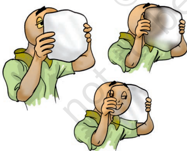
Fig. 4.7 Looking through opaque, transparent or translucent material

You might have played the game of hide and seek. Think of some places where you would like to hide so that you are not seen by others. Why did you choose those places? Would you have tried to