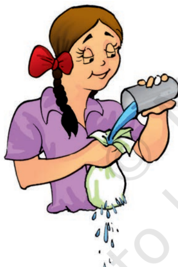
Fig. 4.2 Using a cloth tumbler

Have you ever wondered why a tumbler is not made with a piece of cloth? Recall our experiments with pieces of cloth in Chapter 3 and also keep in mind that we generally use a tumbler to keep a liquid. Therefore, would it not be silly, if we were to make a tumbler out of cloth (Fig 4.2)! What we need for a tumbler is glass, plastics, metal or other such material that will hold water. Similarly, it would not be wise to use paper-like materials for cooking vessels.