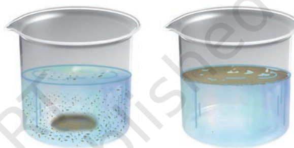
Fig. 4.4 What disappears, what doesn't?

beakers. Fill each one of them about two-thirds with water. Add a small amount (spoonful) of sugar to the first glass, salt to the second and similarly, add small amounts of the other substances into the other glasses. Stir the contents of each of them with a spoon. Wait for a few minutes. Observe what happens to the substances added to water (Fig. 4.4). Note your observations as shown in Table 4.3.