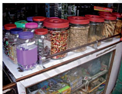
Fig. 4.8 Transparent bottles in a shop

hide behind a glass window? Obviously not, as your friends can see through that and spot you. Can you see through all the materials? Those substances or materials, through which things can be seen, are called transparent (Fig. 4.7). Glass, water, air and some plastics are examples of transparent materials. Shopkeepers usually prefer to keep biscuits, sweets and other eatables in transparent containers of glass or